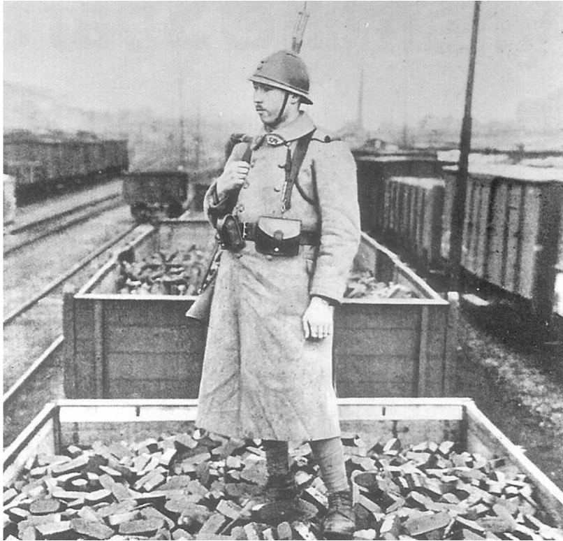
A photograph of a French soldier guarding a train in the Ruhr, 1923.