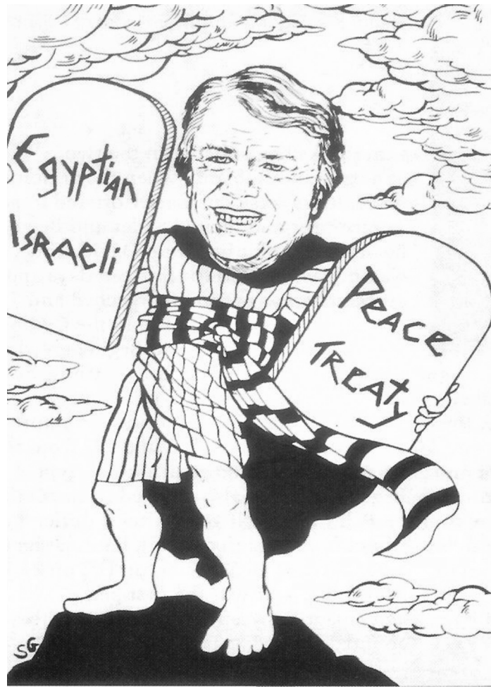
An American cartoon, showing President Carter, published in 1978.

20 Look at the cartoon, and then answer the questions which follow.